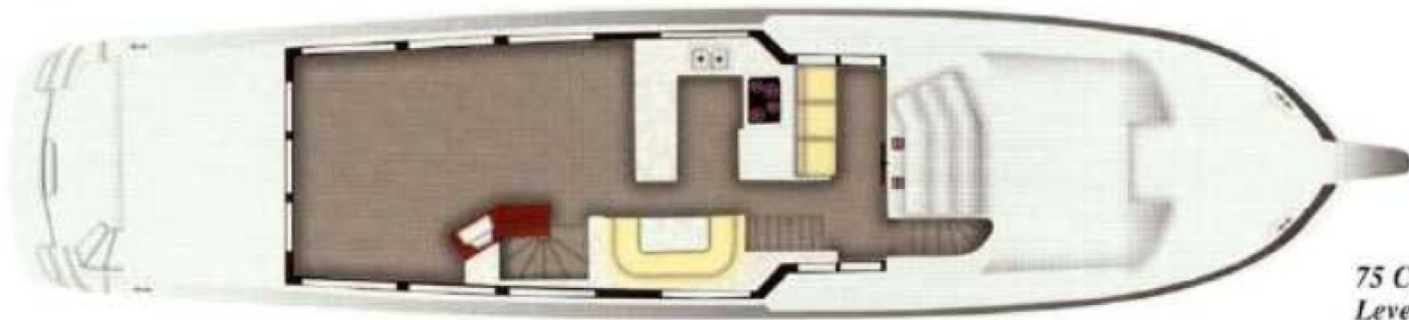
75 Cockpit Upper Level Arrangement